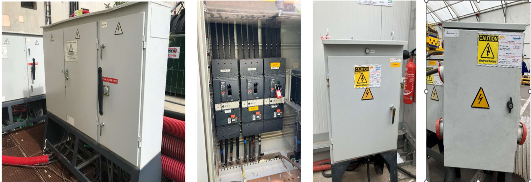
Figure 5 Examples of the electrical components associated with the Temporary electrical network

Examples of a main distribution panel an electrical cabinet and 400-volt socket box installed on site